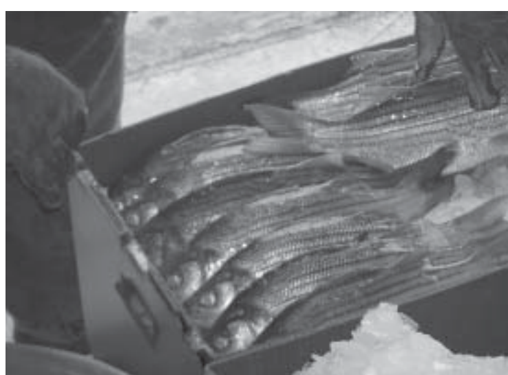
Bass are packed in a box and ready for another layer of ice and a lid.